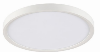
White Aluminum Housing & Frosted Plastic Lens