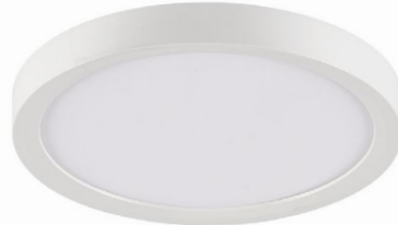
White Aluminum Housing & Frosted Plastic Lens